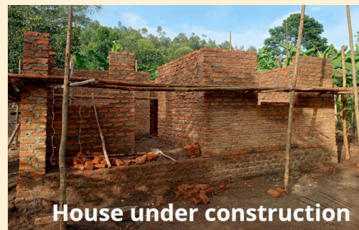
House under construction