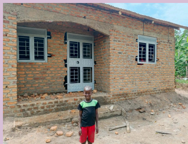
Ritah's family house near completion