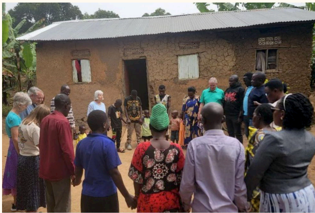
Praying at one of the homes during our 2025 Uganda Trip

A generous person will prosper; whoever refreshes others will be refreshed. ~ Proverbs 11:25